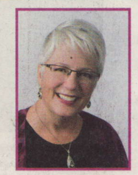
Working in the Healing Oasis

Do you bound out of bed every morning excited by anticipating what you can create? If you are new to awakening or just curious, then this workshop would give you a greater understanding of how energy is impacting your life. The only way to live beyond limits, to experience true joy and freedom, and to be abundant is to live a balanced life. All of creation creates energy, understanding how to use your share wisely makes life satisfying.